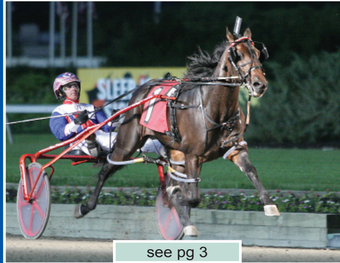
see pg 3