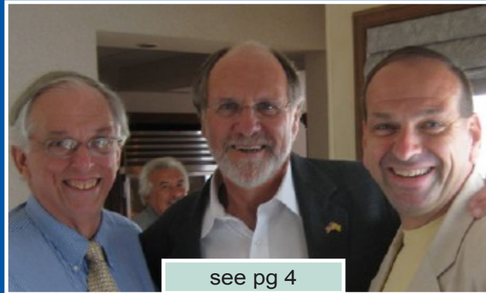
see pg 4