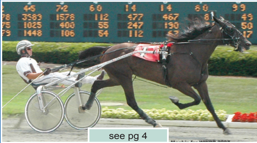
see pg 4