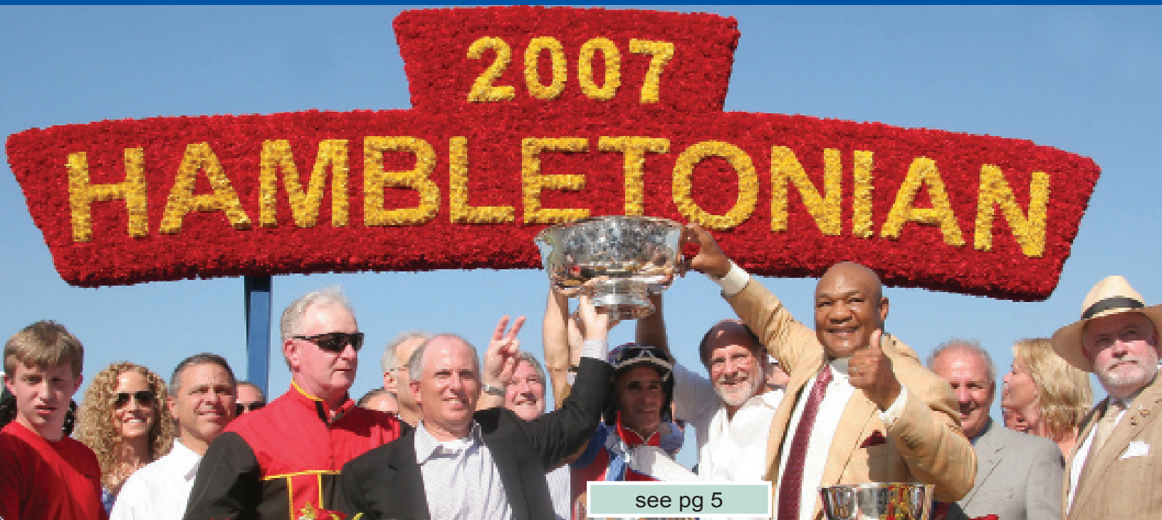
see pg 5